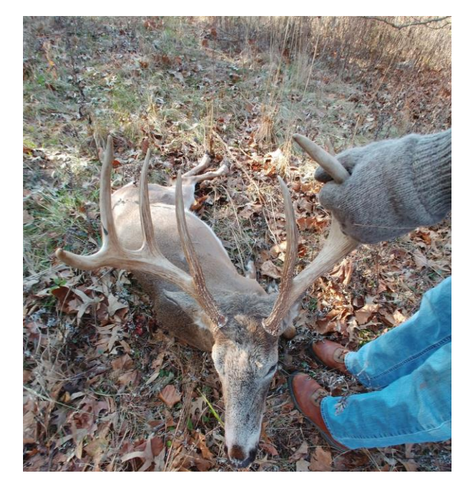
George's big 7-pointer shot on 12/30/2020!

What are YOU up to this spring? Send in your photos!