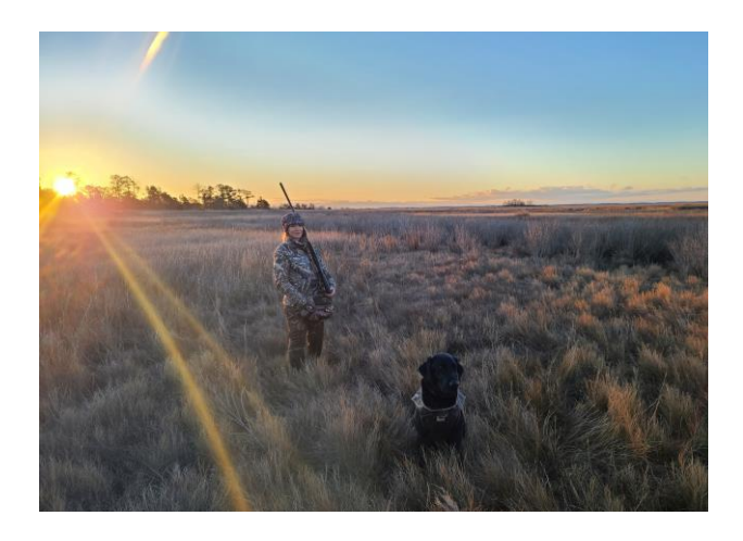
Lauren on a duck hunt on the last day of the season. 1/30/2021