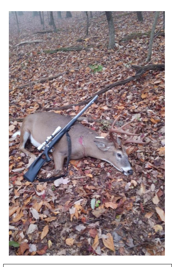
Big chocolate-rack 8-pointer shot by Jon Schweitzer this fall! 215lbs, 165lbs dressed out.