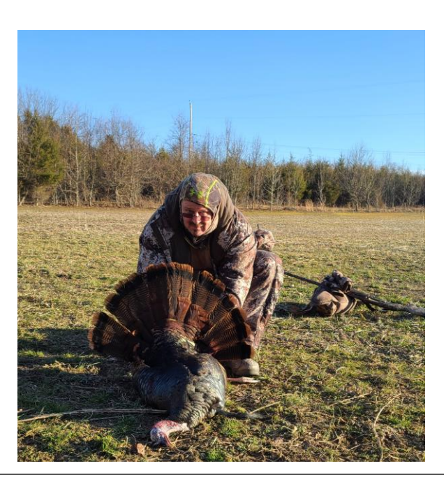
Sloane's winter tom shot on 1/21/2021!