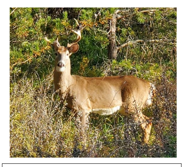
Big buck seen by Scott B. on the club grounds on 11/17/2020!