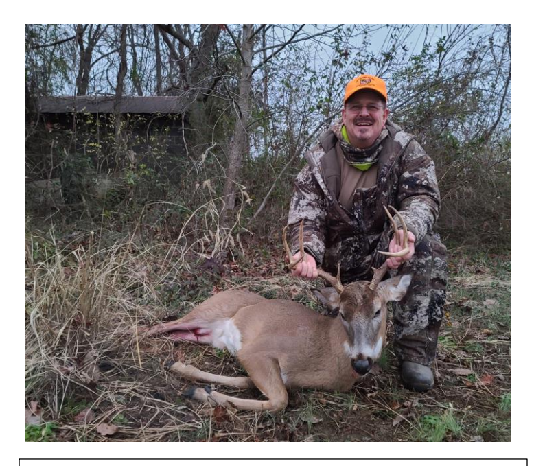
One of two mature bucks that Sloane got this season! 12/5/2020