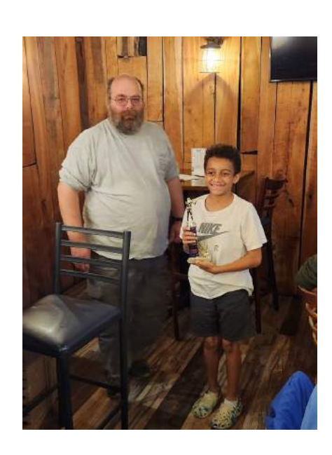
Air Gun Banquet 2023