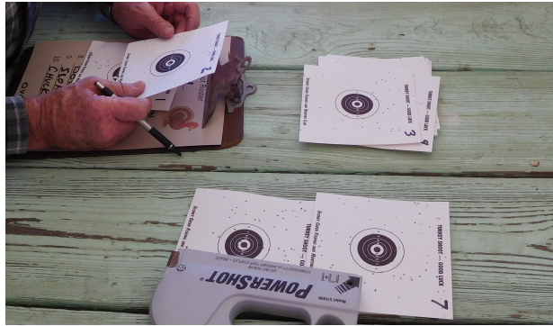
Round one winner: Lauren Atwood